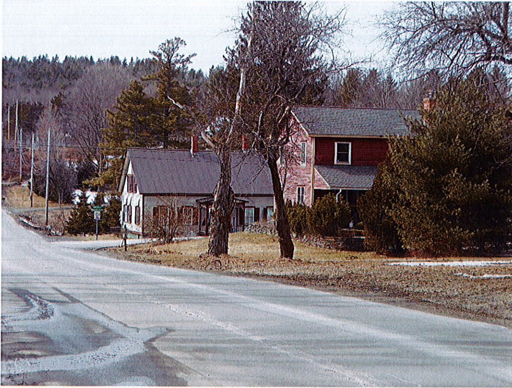
F. Photo of 13 Shed Road (Building 3) and 144 Crosstown Road (Building 4) from Crosstown Road (West)