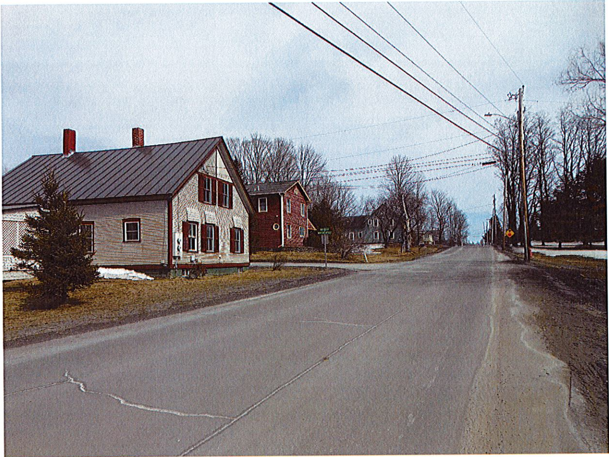
I. View of 13 Shed Road (Building 3), 144 Crosstown Road (Building 4), 106 Crosstown Road (Building 5), and 72 Crosstown Road (Building 6) from Crosstown Road (East – Western Boundary)