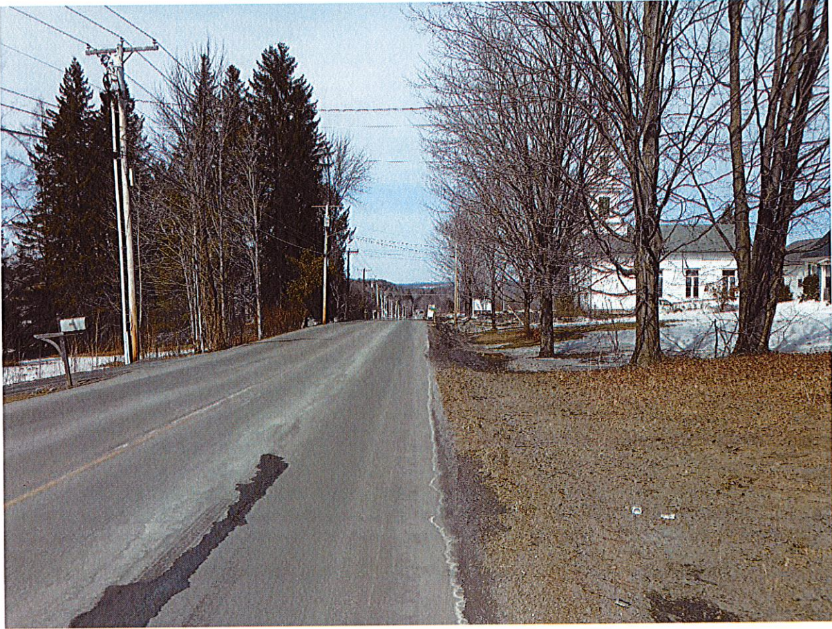
M. View of 1808 Scott Hill Road (Building 18 – Church) from Scott Hill Road (North – Southern Boundary of Village)