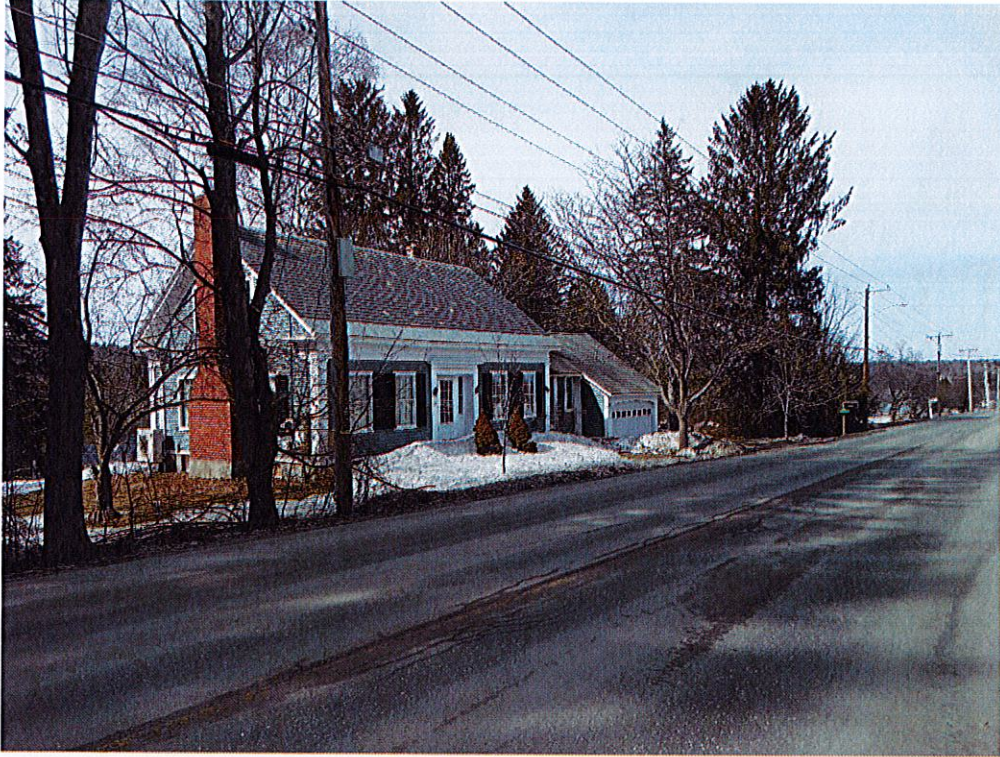
L. View of 1821 Scott Hill Road (Building 15) from Scott Hill Road (North)