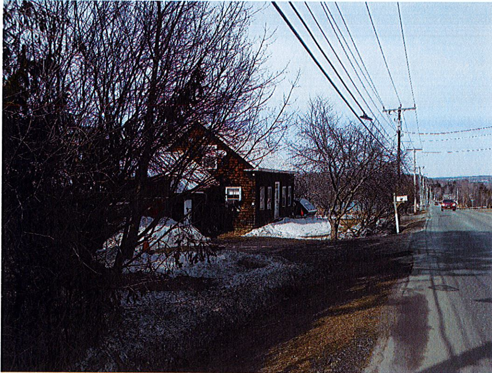
J. View of 1861 Scott Hill Road (Building 14) from Scott Hill Road (North)

Historic Photo (Structure no Longer Present):