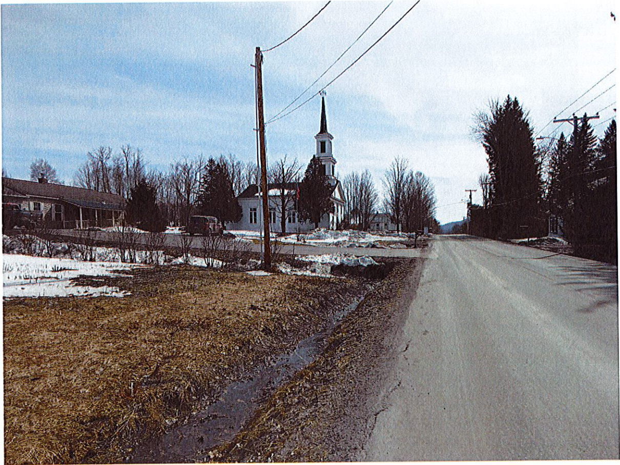
K. View of 1830 Scott Hill Road (Building 17) and 1808 Scott Hill Road (Building 18 – Church) from Scott Hill Road (South)