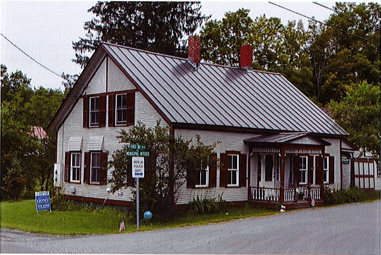
H. View of 13 Shed Road (Building 3) from Crosstown Road. Historic home of Blacksmith, on National Historic Register (1845)