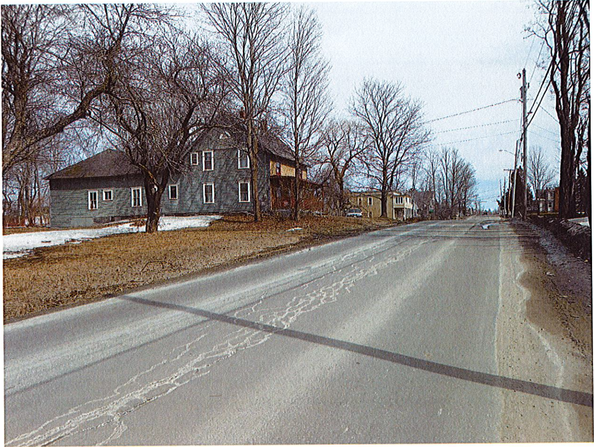
G. Photo of 106 Crosstown Road (Building 5) and 72 Crosstown Road (Building 6) from Crosstown Road (East)