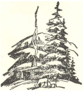
Cover page of the Sesquicentennial Program.